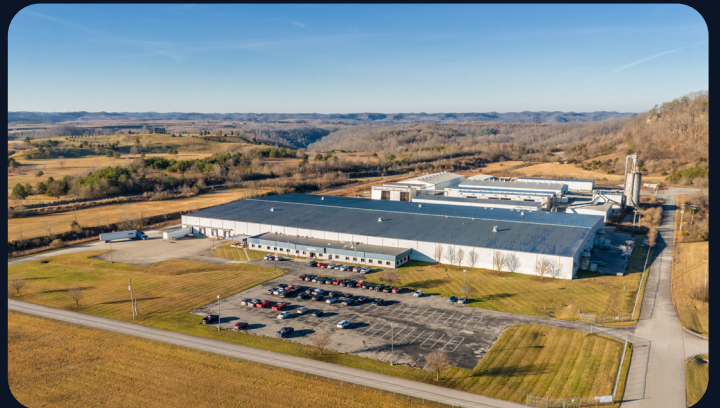
101 Kilby Way, Chavies, KY 41727 United States