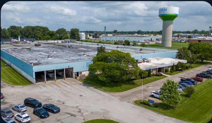
155 Irwin Street Chatham, ON N7M 0N5 Canada

We are your single source, dual facility aluminum extrusion supplier with operations in Chatham, Ontario and Chavies, Kentucky. Our combined manufacturing space of 500,000 sq ft and our central locations in both Canada and the USA well position us to supply extruded, fabricated, and anodized aluminum components across North American marketplaces.